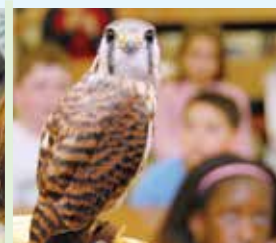
Aquarium photos courtesy of Heidi Gumula – DBVW Architects.